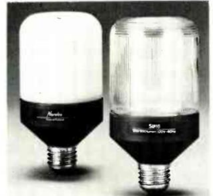
THE NEW SL-18 is close in size to the standard 60-watt incandescent lamp, and is designed to fit standard light sockets. It will last 7½ times longer than the oldstyle bulb and consume 70% less energy, reflecting a substantial decrease in the user's electric bills.

—Radio Electronics magazine, 1980— Courtesy of Brian W9HLQ