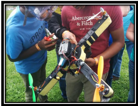
Post 579 inspects their custom quadcopter after a minor mishap involving a tree.

The competition is divided into three parts. Two of them are surveying missions – in one, participants are asked to use a drone and a camera to identify different species of aquatic birds around the pond, and in the other participants use the drone and camera to create a map of the ecosystems around the pond. These two challenges are relatively simple, but that doesn't mean they are easy. Chicago is, after all, the windy city, and maintaining stable flight while trying to take pictures of birds requires a steady hand and a good bit of practice. The environmental survey flight can use a GPS to follow a predefined course, but since much of the drone software is still in its infancy, getting the drone to use the GPS to navigate requires a lot of fiddling. Post 579 ended up flying this mission by hand after a glitchy GPS flew one of their quadcopters straight into a tree.